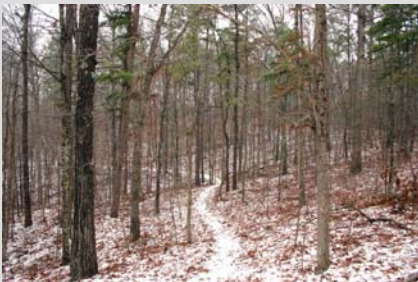
A light dusting of snow outlines trail on the Middle Fork