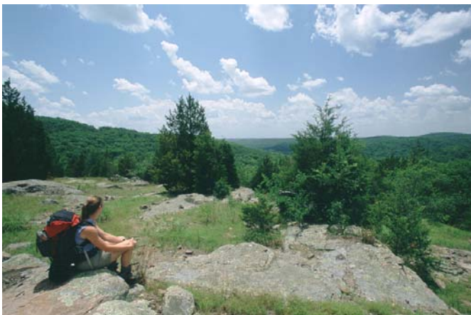
You can get there from here; using the online trip planner, hike to this overlook of the Ottery Creek Valley and Southwest Bell Mountain

We're happy to announce the newest feature of the Ozark Trail Association website: the Ozark Trail Trip Planner. Visit www.ozarktrail.com/planner for a peek at the first phase of our work, which covers the Middle Fork, Taum Sauk, Karkaghne and southern Trace Creek sections of the Ozark Trail, plus the connecting trails at Council Bluff and Bell Mountain Wilderness.