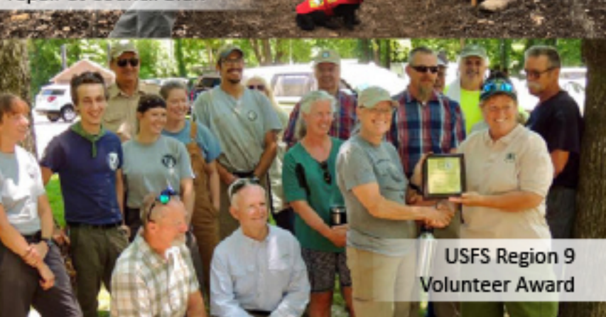
USFS Region 9 Volunteer Award